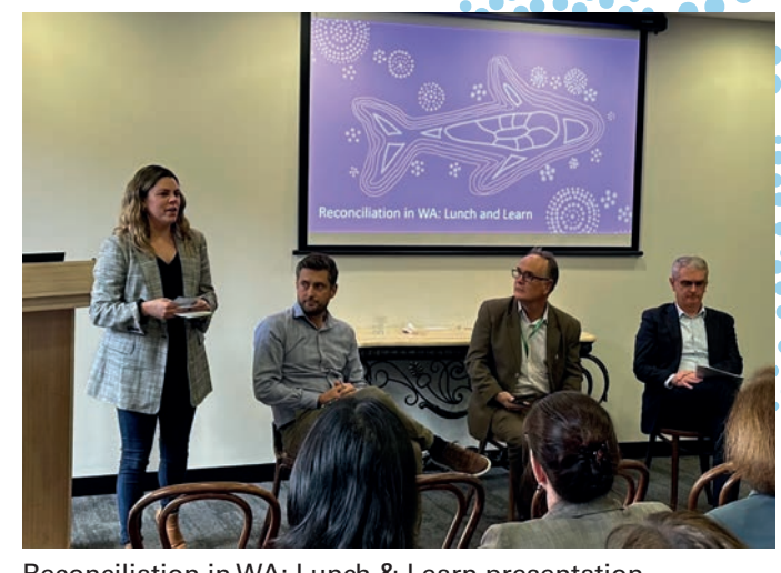
Reconciliation in WA: Lunch & Learn presentation