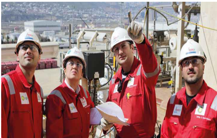
Permanent professional employees in Azerbaijan (%)