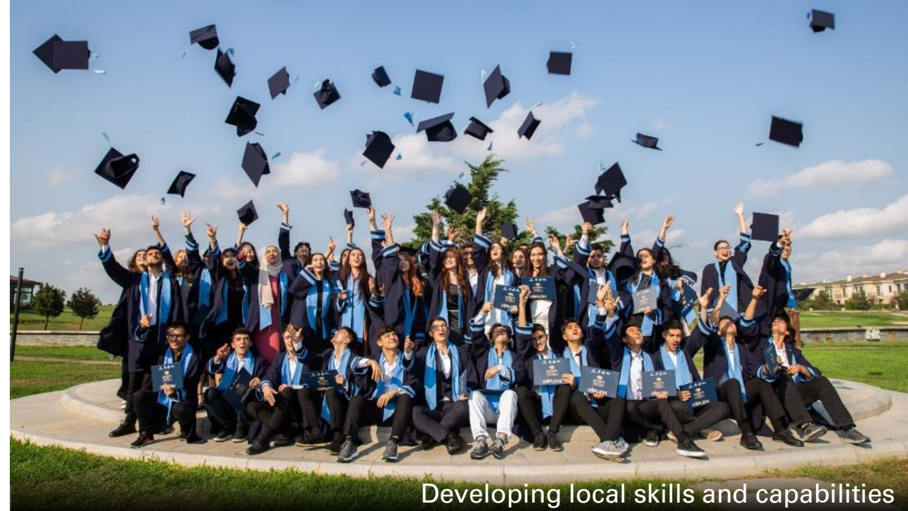
Developing local skills and capabilities