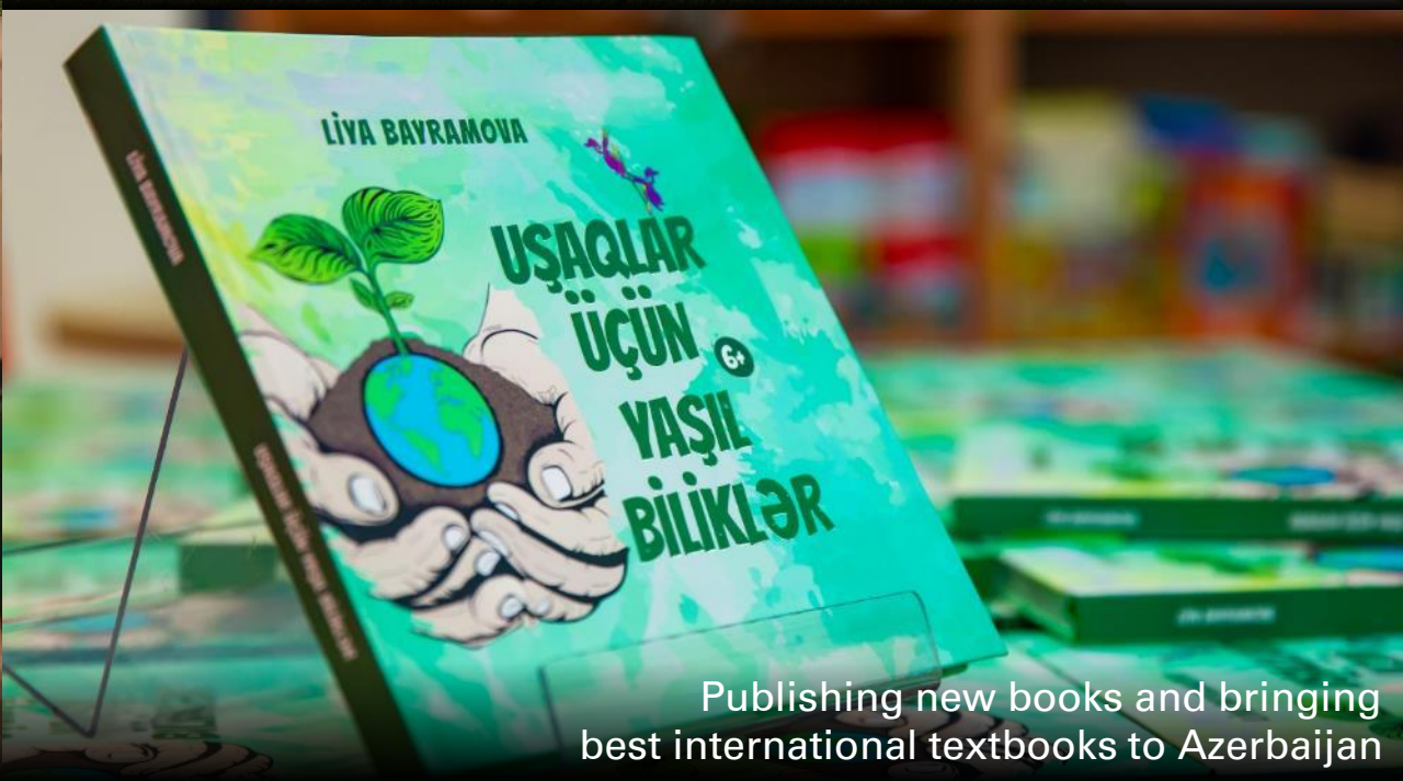
Publishing new books and bringing best international textbooks to Azerbaijan