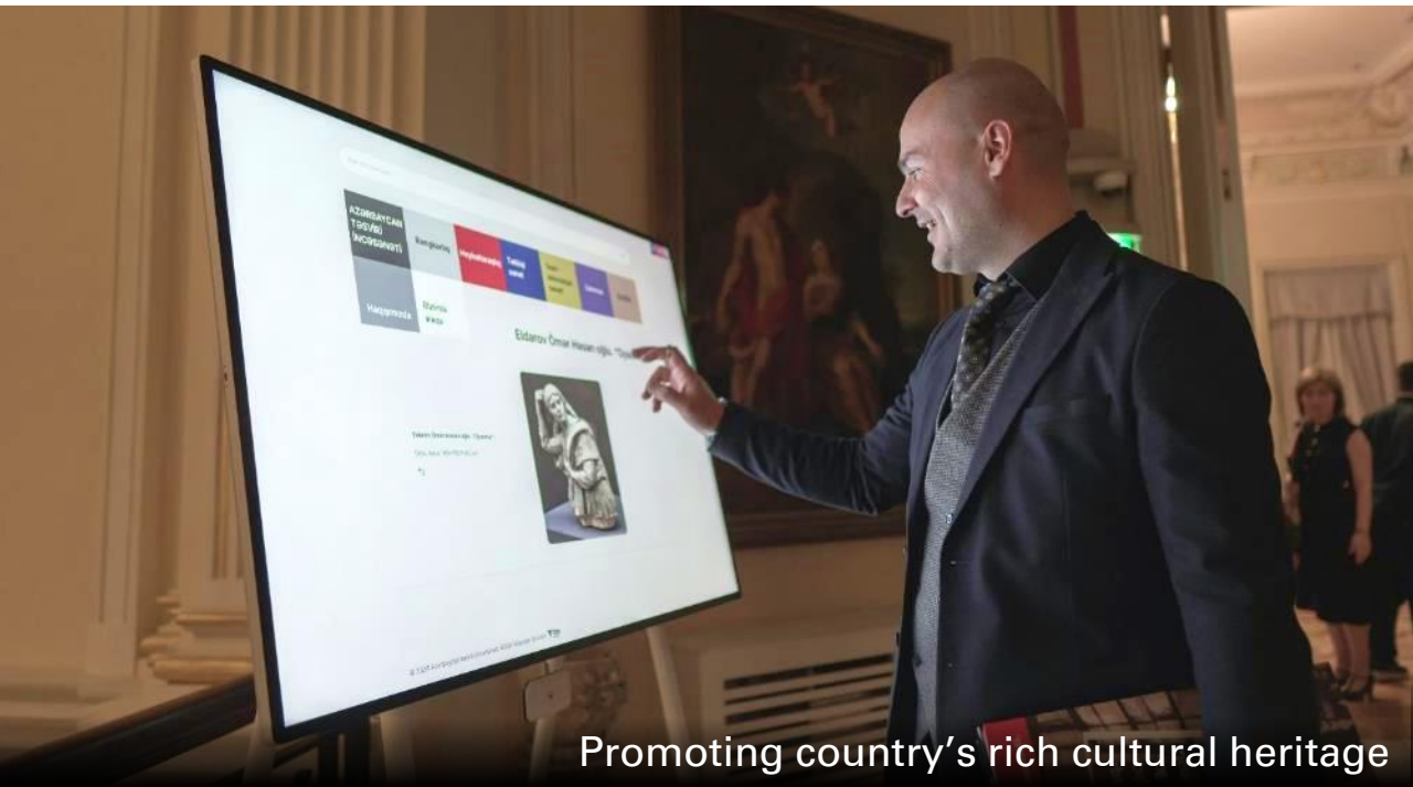
Promoting country's rich cultural heritage