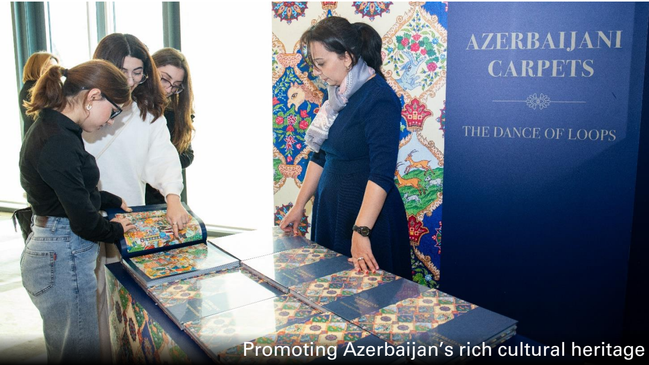
Promoting Azerbaijan's rich cultural heritage