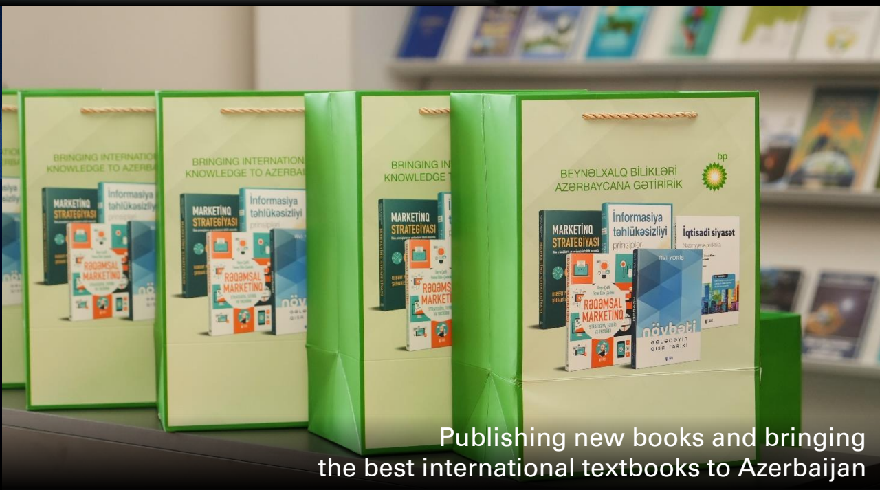
Publishing new books and bringing the best international textbooks to Azerbaijan