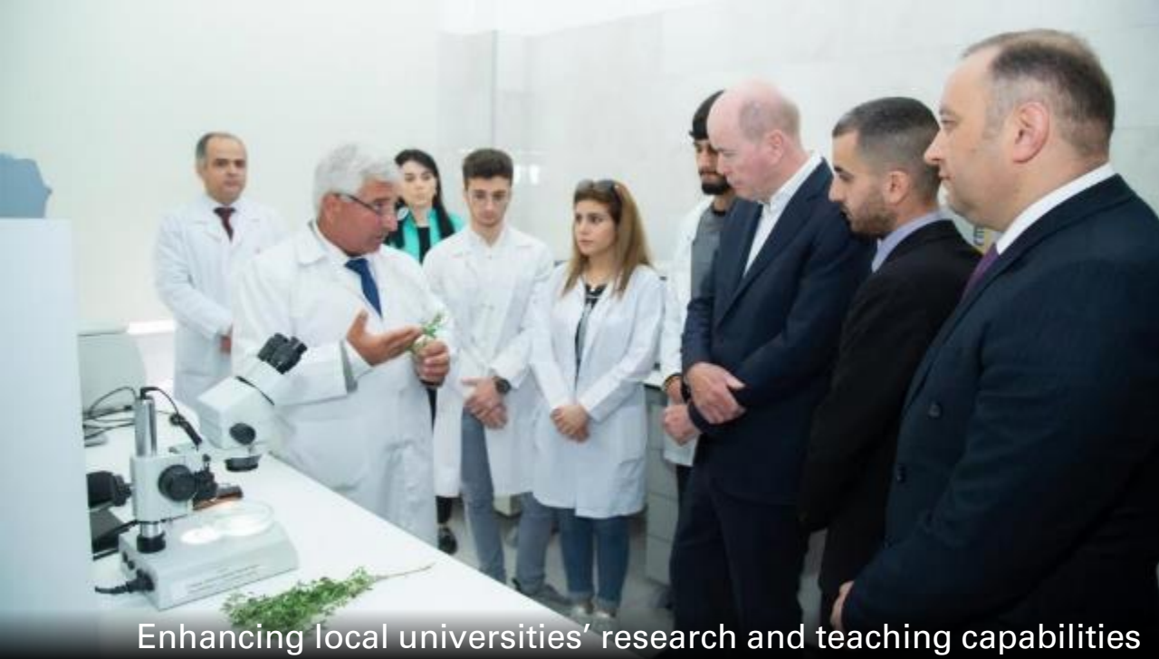
Enhancing local universities' research and teaching capabilities