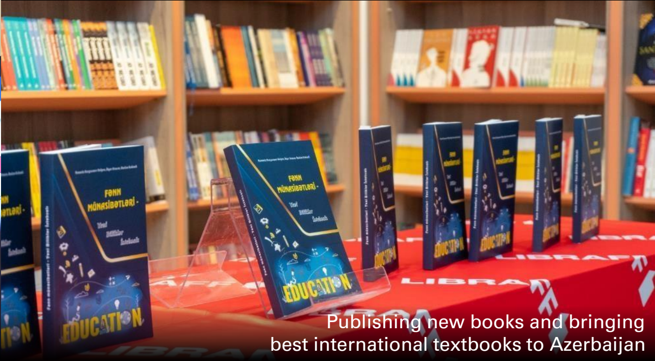
Publishing new books and bringing best international textbooks to Azerbaijan