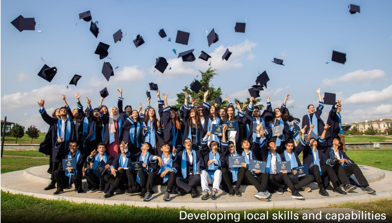
Developing local skills and capabilities