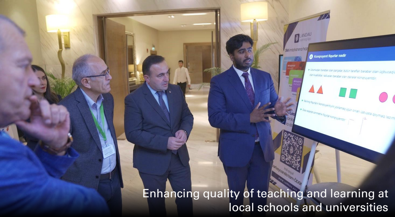
Enhancing quality of teaching and learning at local schools and universities