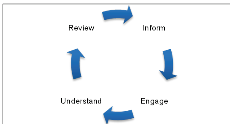
Figure 3-2: Consultation and Disclosure Process

This cyclical process is illustrated in Figure 3-2.