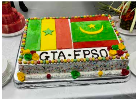
FPSO ceremonial cake