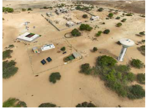
Aerial view of the water project

This project was truly a collaborative effort from both bp and the government represented by the Office National des Services d'Eau en milieu Rural; a government institution responsible for water management in rural areas. Implemented by non-governmental organization Ecodev, this project addresses critical water needs identified through a community assessment. The project has been regarded as a significant social investment by the Mayor of N'diogo, cementing bp's commitment to sustainable development.