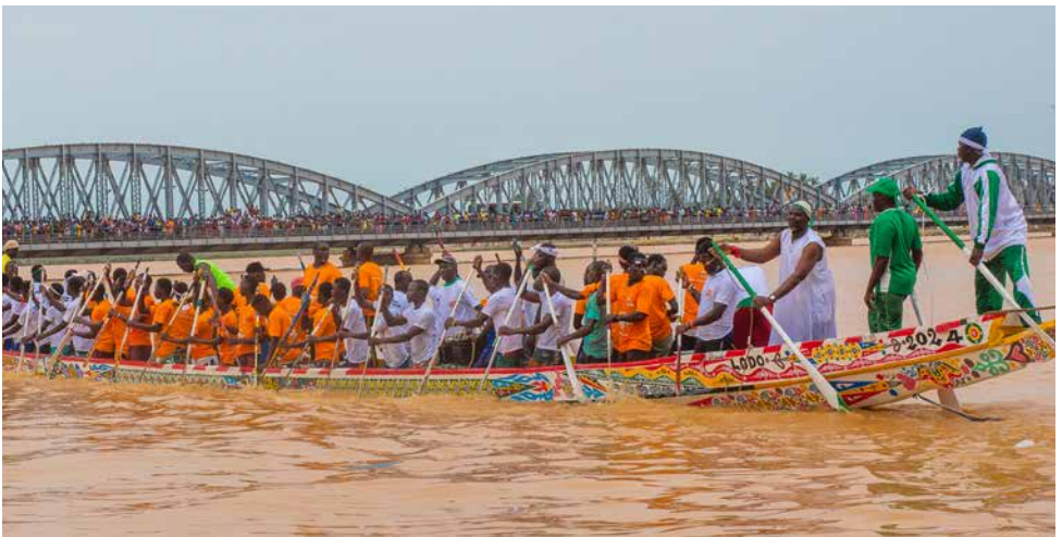
One of the Regatta teams greets the crowd before the race begins