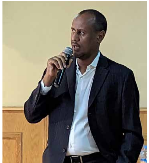
Speaking at a social performance workshop in Nouakchott

I engage with locals regularly, listen to their needs and concerns and most importantly, try to address them. We focus on priority needs and respond to them through projects which go through rigorous evaluation and monitoring processes.