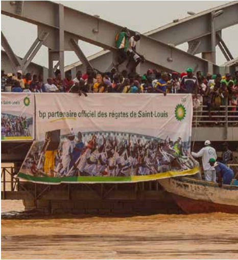
Spectators on the Saint-Louis Faïdherbe bridge

Members of the GTA project team attended the event again this year and thoroughly enjoyed the energy and pace of the atmosphere. This event attracts global interest and sailing enthusiasts, boosting local tourism and bringing excitement to participants and spectators alike.