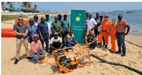
Trainers and participants at shoreline training