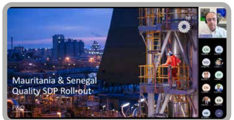
Online Quality Management session