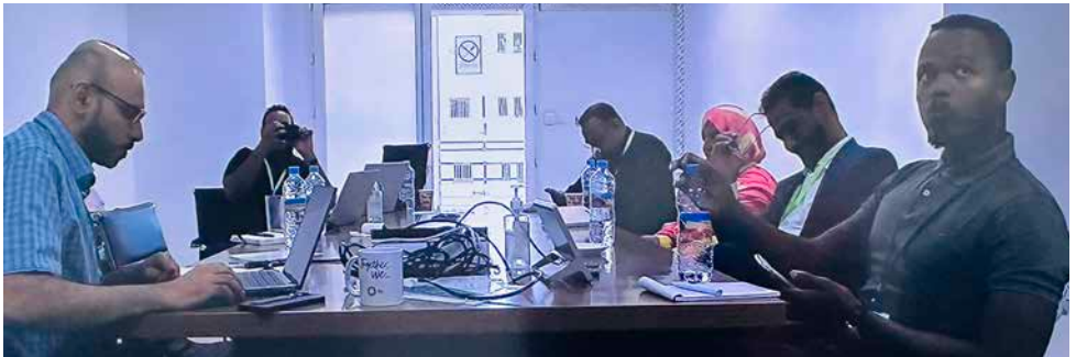
Participants taking part in a face to face session

The Supplier Development Programme launched in July, beginning a series of online and in-person sessions designed to enhance skills and capabilities in bp's selected local suppliers.