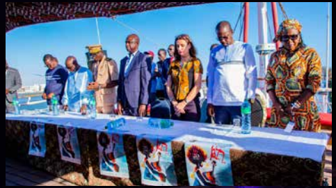
Jazz festival opening ceremony

We also hosted a booth in the sponsor village providing visitors, both local and international, with the latest updates on the GTA project and its benefits for the region. The festival remains a vital cultural event attracting international performers and guests, and we are proud to be part of its ongoing success.