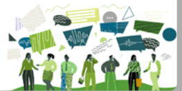
Online Tax session