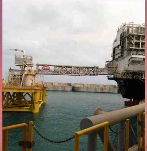
FLNG gangway to Hub

The FPSO is progressing well and the team are finalizing and testing readiness for start-up and introduction of gas from the wells.