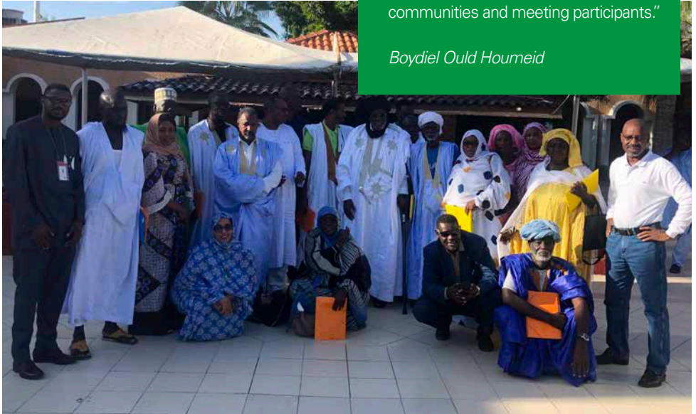
Attendees and bp staff