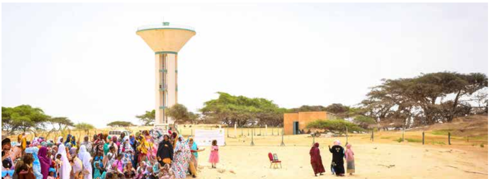
Residents from the local community gather for the inauguration

residents will receive clean drinking water