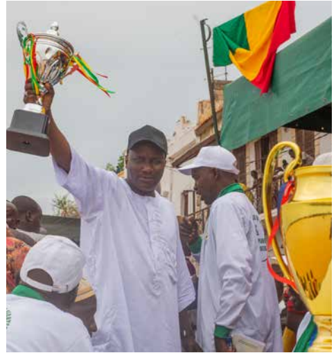
Celebrating the winners