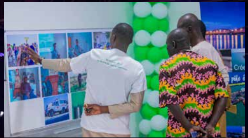
Visitors at the offsite event