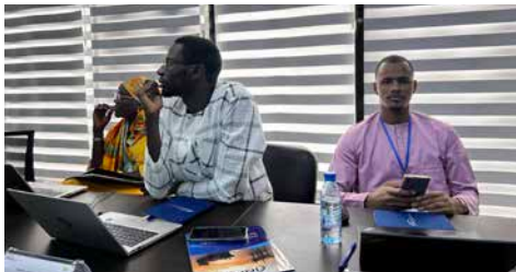
In-office training session

This initiative represents a significant achievement in the Saint-Louis region, attracting considerable interest and demonstrating the potential for sustainable fish sourcing alternatives beyond traditional sea fishing. The Kër Entrepreneur Centre aims to sustainably support local talent and entrepreneurs with essential tools for success. We are excited to see this initiative develop, given its ability to empower future talent.