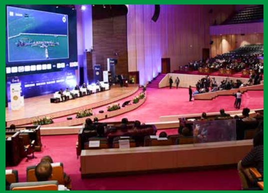
GTA presentation at MSGBC conference