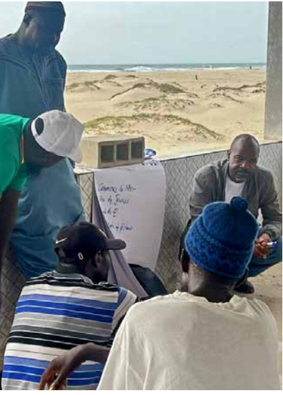
Delivering a focus group with community leaders

Effective communications plays a crucial role in this process, as we must clearly explain our