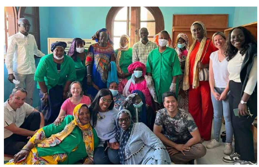
bp teams at a female-run cereals transformation facility

An in-country operations specialist is a functional role designed to support efficient project delivery at the Greater Torture Ahmeyim (GTA) project. We integrate production teams across various activities, ensuring everyone is aligned and working towards the same goal.