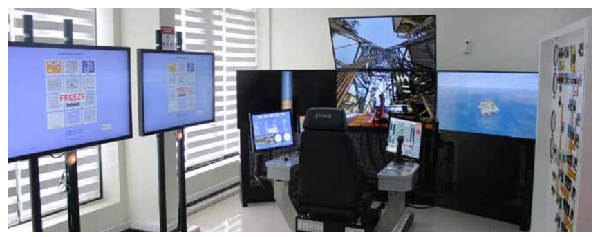
The full-scale simulator. It meets and exceeds training and accreditation standards for drilling and well control in the oil and gas industry.

Through our collaboration, we are proud to contribute to the development of programmes and resources, which in turn will enable the development of a highly skilled local workforce for the future of the energy industry.