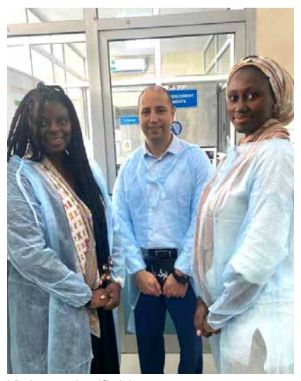
Visting a scientific laboratory

information and align our goals. These meetings allow us to identify bottlenecks in activities and propose solutions to overcome them.