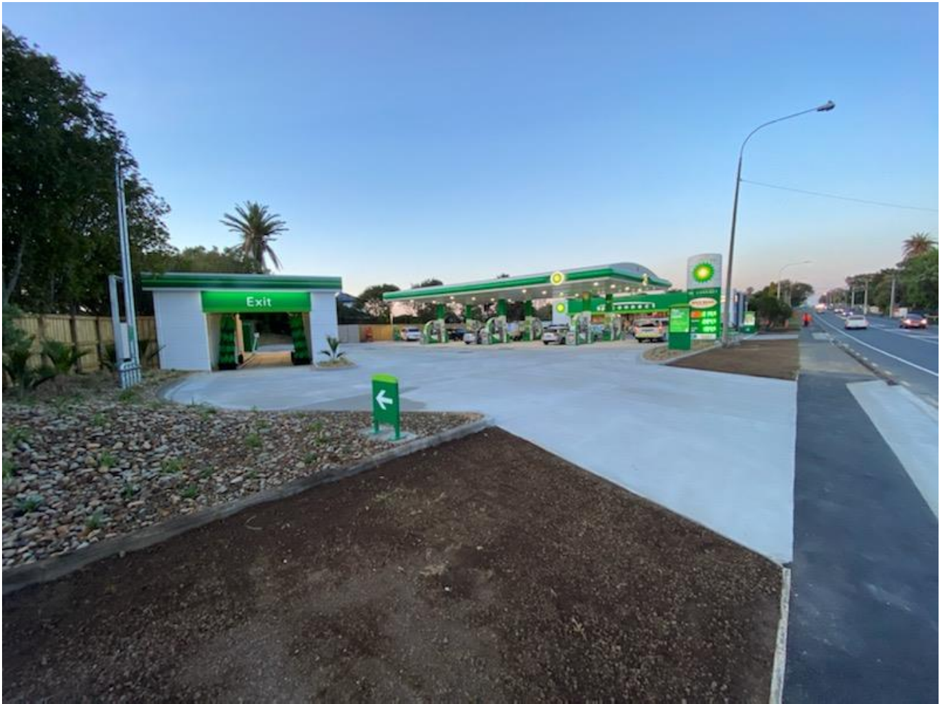
Caption: BP Connect Clifton open for business