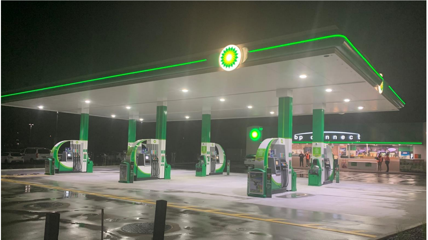
Caption: bp Connect Bethlehem open for business