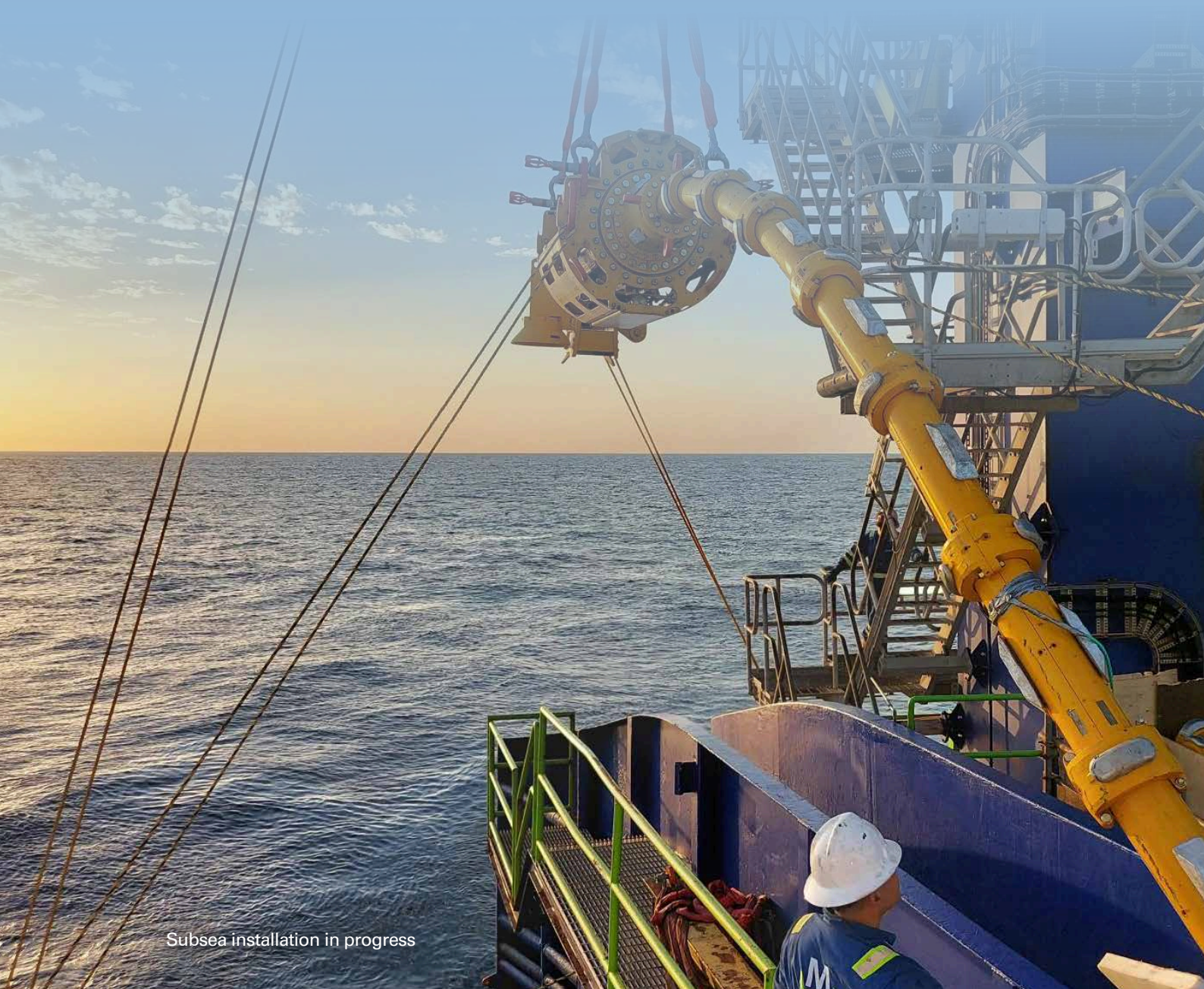
Subsea installation in progress

Having reached more than 87% completion, GTA is now in its most important phase. The teams are working hard to ensure a smooth hook-up and integration, start up to bring all the pieces together into one single mega-project.