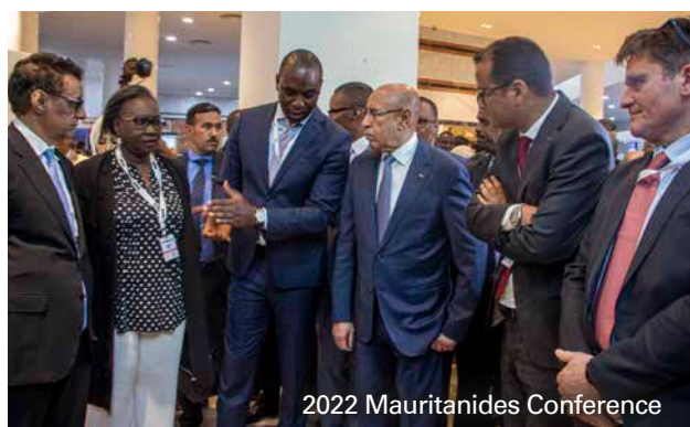
2022 Mauritanides Conference

Thank you to everyone who visited our bp exhibition stands at both events we hope you enjoyed the GTA virtual reality experience.