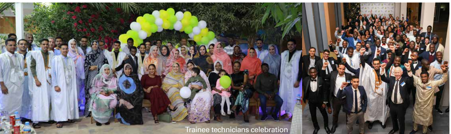
Trainee technicians celebration

We wish good luck to all the national apprentices!