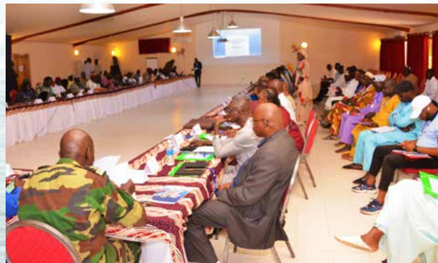
Fishing communities discussion forum in Saint-Louis

On 13 and 14 December 2022, the Local Artisanal Fisheries Council (CLPA) of Saint Louis organized a forum to discuss “Issues and challenges of fishing in Saint Louis: context of gas exploitation” in collaboration with local and ministerial authorities and with the support of bp and other partners.