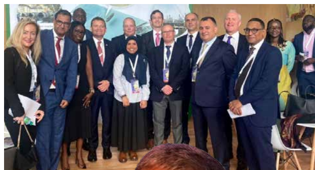
bp exhibition stand at the MSGBC in Dakar