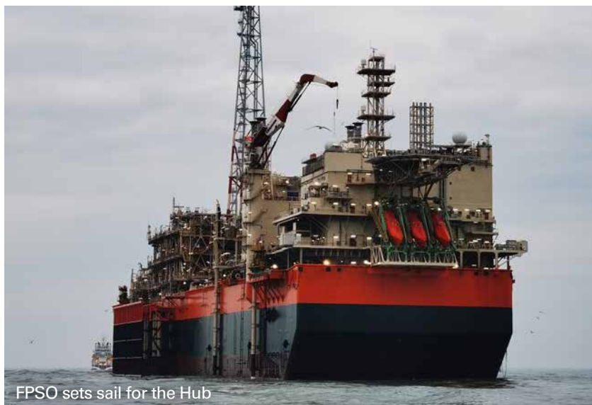
FPSO sets sail for the Hub

The QU platform was safely delivered, installed, and has gone live which marked the completion of all the major offshore installation scope associated with the Hub. The offshore hook up has successfully commenced and is progressing to plan with almost 60% complete and all disciplines and trades now progressing offshore. The focus remains on piping and cable pulling activities with QU habitation expected in 1Q 2023.