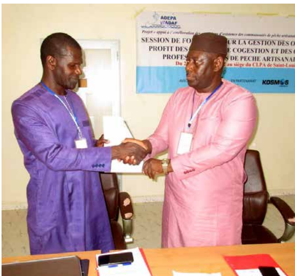
Training course for Artisanal Fisheries

As part of the session the participants simulated the creation of a professional fishing organisation, including its function and status, as well as the roles of the different members.