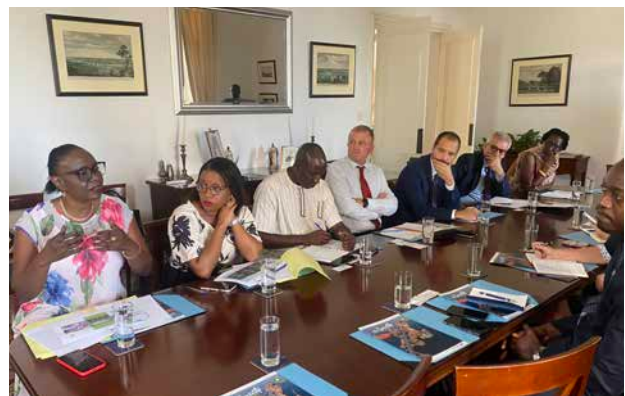
GTA information and project update session at the UK Embassy

bp continues to enjoy a close working relationship with the UK Embassy since its establishment in Senegal in 2017.