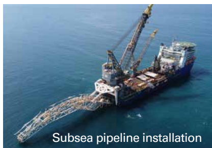
Subsea pipeline installation

The Subsea team ended 2022 on a high with the installation of all flexible risers and production umbilicals (120km total length). They also completed 70% of the pipeline installation (approximately 225km of 320km). The main static umbilical is almost 81km long, which makes it the longest umbilical ever installed by bp. The team's focus is now on the subsea production structure delivery and the remaining subsea campaign for 2023.