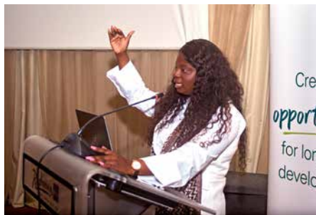
Suppliers engagement workshop in Dakar