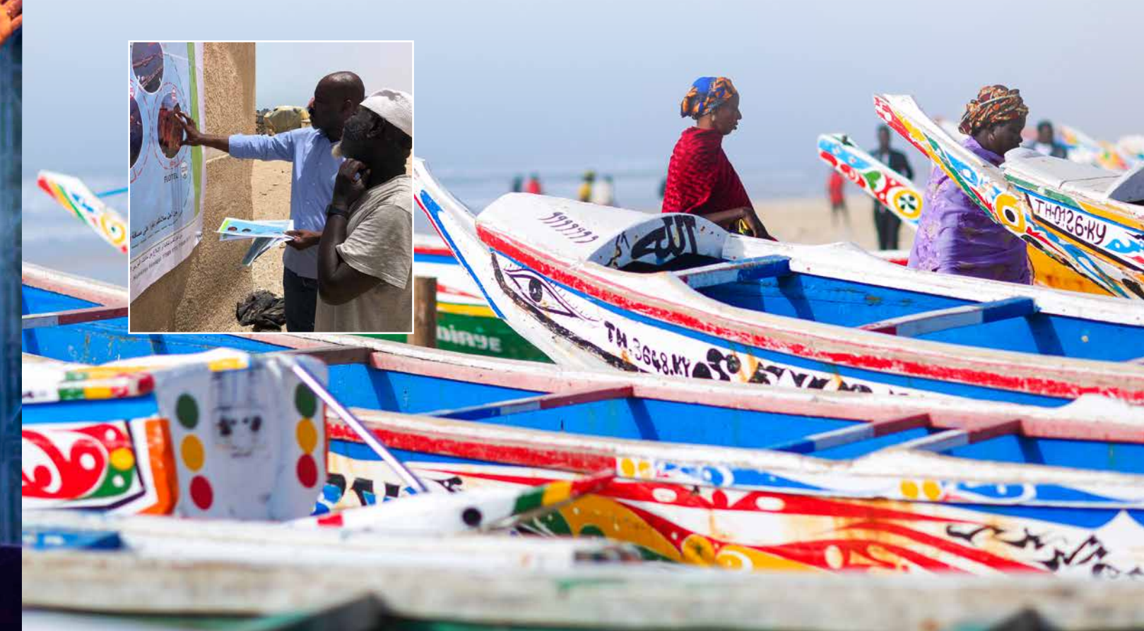
Engagements with the fishing communities in St Louis and N'diago

The aim was to provide updates on current activities and convey important safety messages. During these meetings, information was shared on the