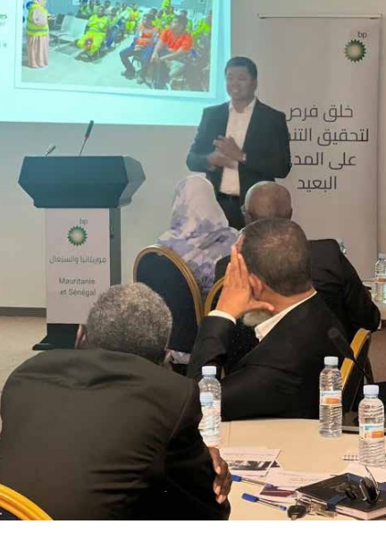
Participants at the workforce development workshop