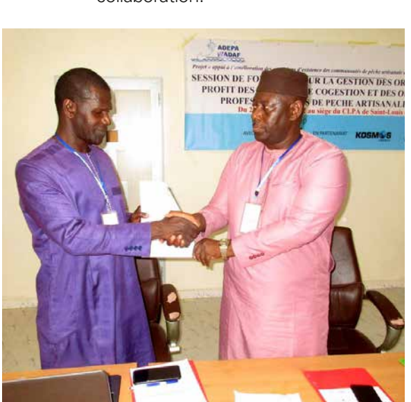
Training course for Artisanal Fisheries

The objective of the workshop was to contribute to the institutional and organisational capacity of artisanal fisheries professionals, in order to improve the internal governance of their organisations and promote collaboration.